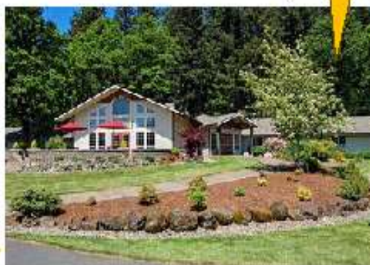
Aldersgate Main Lodge, Meeting Rooms, and Dining Hall

Come have fun with your LWML Friends September 22-24, 2023